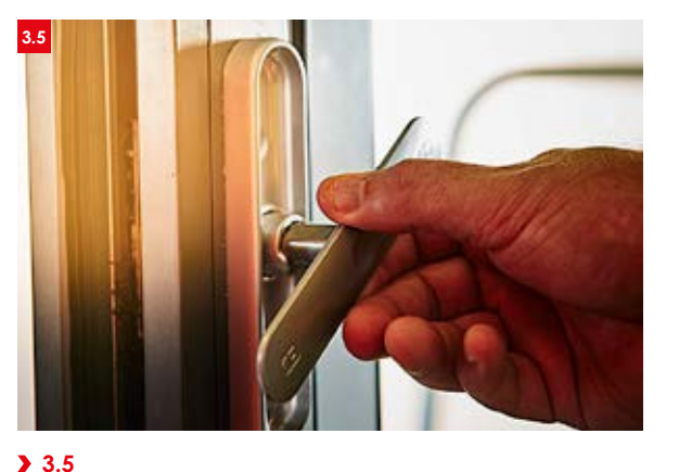
Check that the hardware is operating correctly.