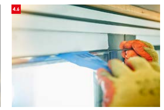
> 4.6 And the top corner which is diagonally opposite to the glass packing at the bottom.