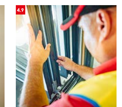
> 4.9 Check the operation of the hardware and doors.