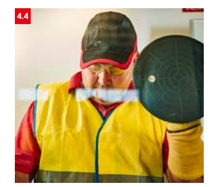
▶ 4.4 Seat the glazing unit on to the packers.