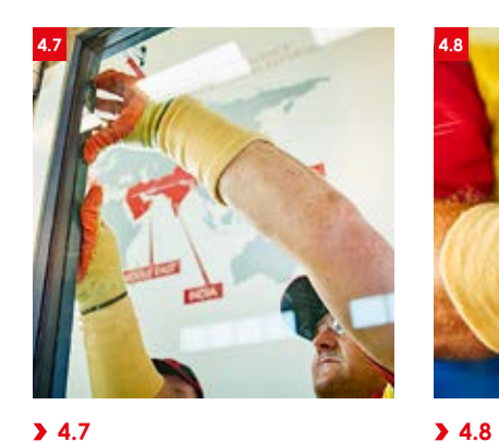
Carefully fit the horizontal beads first and then the vertical beads.