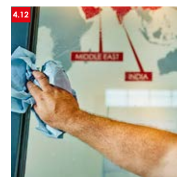
> 4.12 Remove tape and clean down glass and metal.